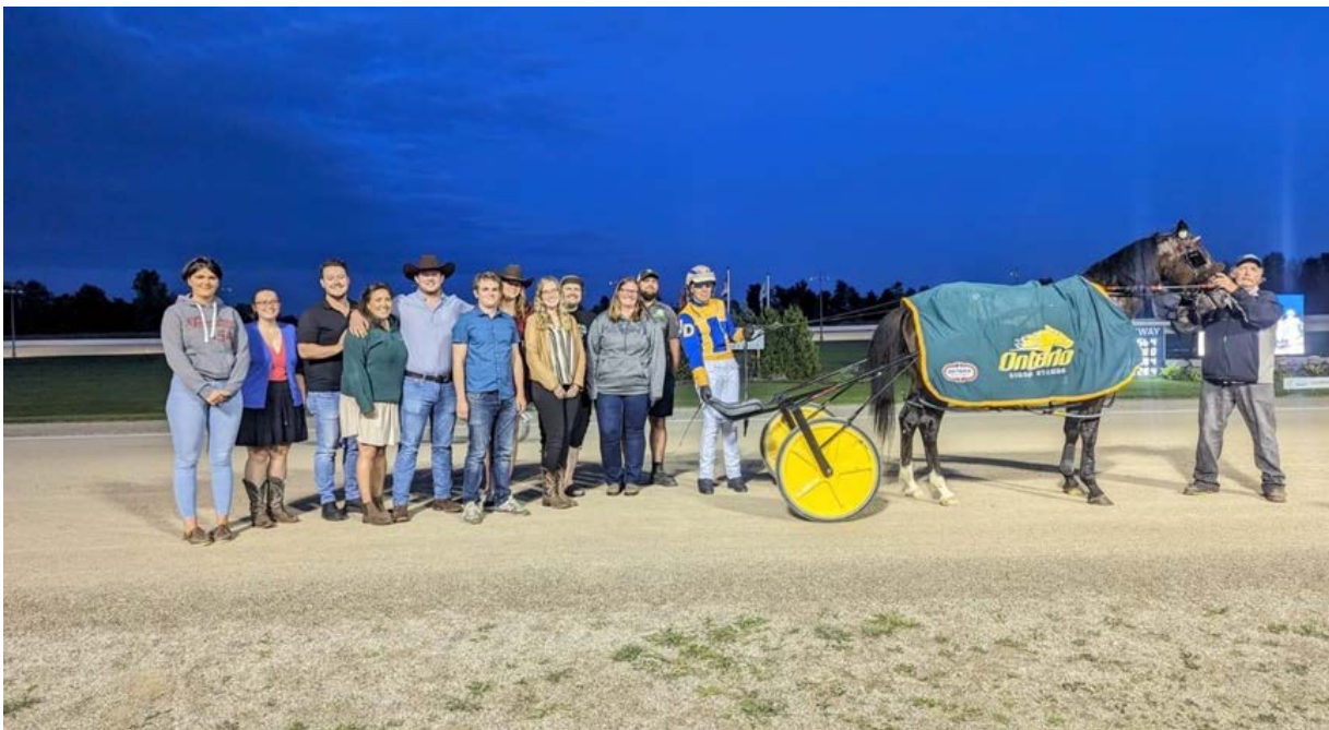
A picture with the winning horse from the Junior Farmers' race.