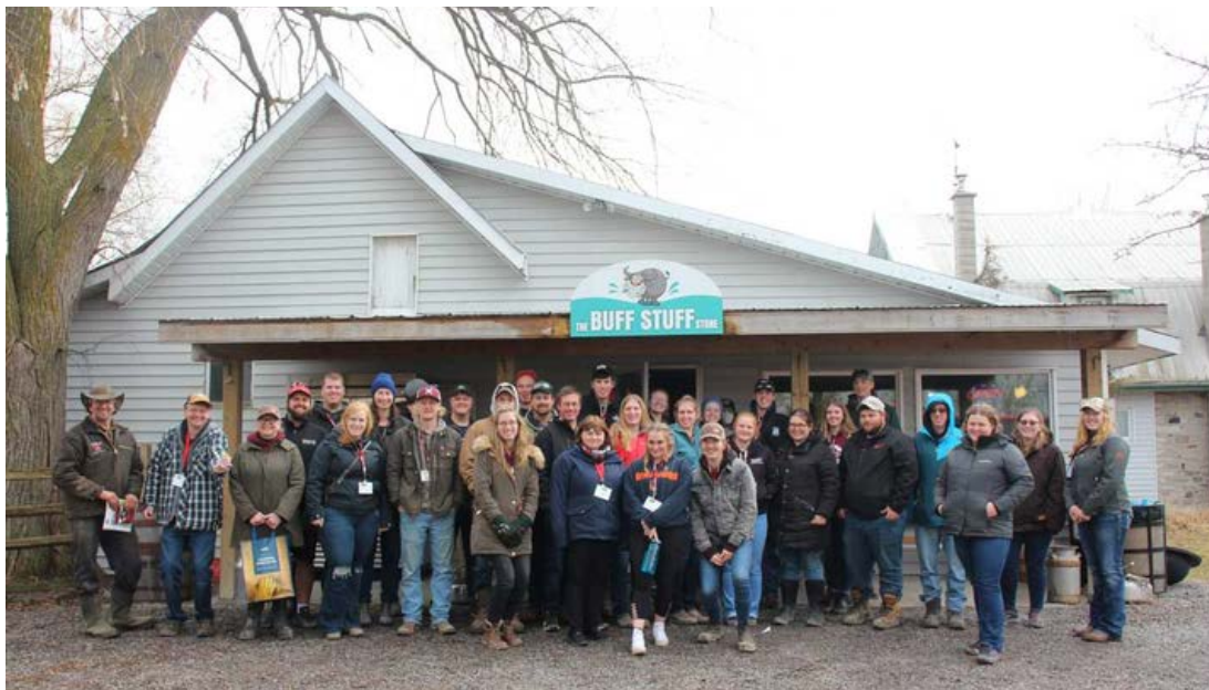
Ontario Water Buffalo Company, March Conference 2022, Peterborough