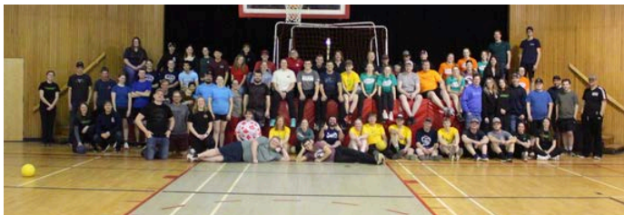
Winter Games Attendees