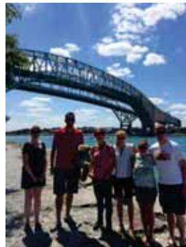
Some highlights from the international delegates tours around Ontario.