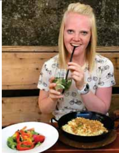
Left (L-R) - Eating a traditional Austrian Spätzle with a traditional Austrian drink; Preparing apple strudel; Enjoying a traditional Austrian meal after a long hike.