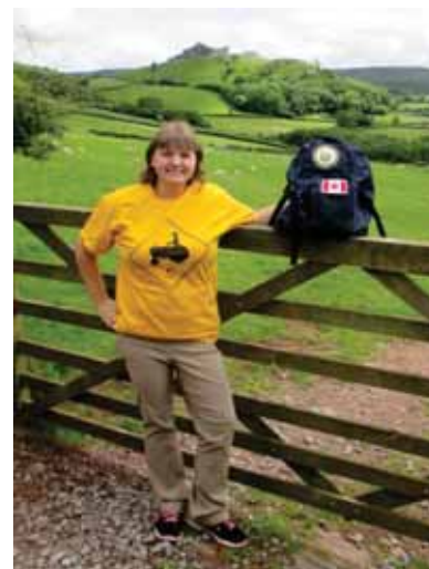
Above - Enjoying the beautiful landscape in Wales and visiting Carreg Canen, a castle built during the 13th Century.