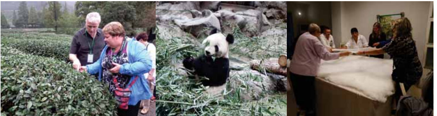
L-R: Learning how to pick tea leaves; Panda at Beijing Zoo; Silk cocoons being made into a duvet