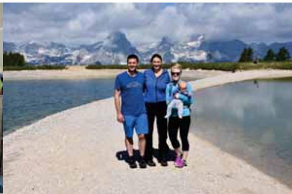
Above (L-R) - Helping sell apples at the local market; At my host family's annual apple festival; Hiking with my host family at Hinterstoder Hoss.