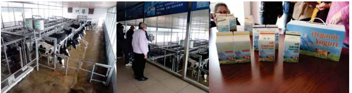
L-R: Green Yard Organic Dairy Farm; Viewing milk time in China; Milk and yogurt produced on farm by Green Yard Organic Dairy Farm.