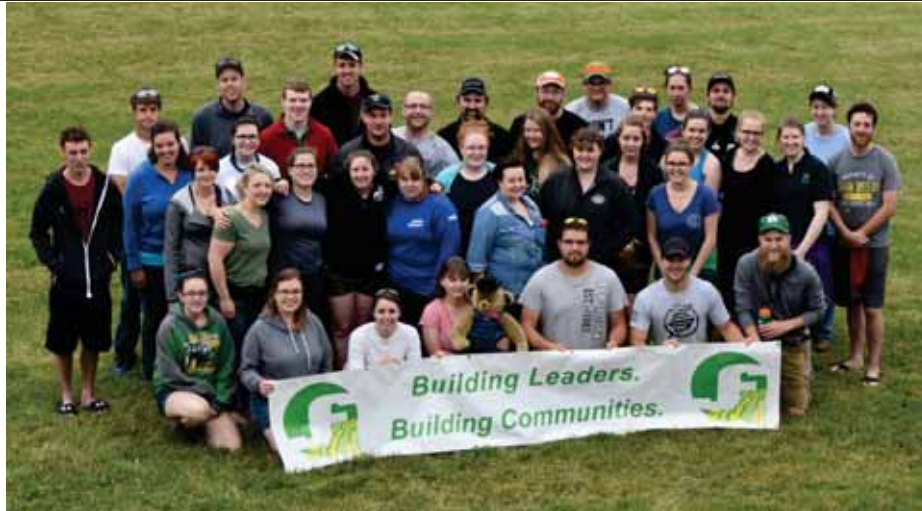
2016 Leadership Camp Delegates