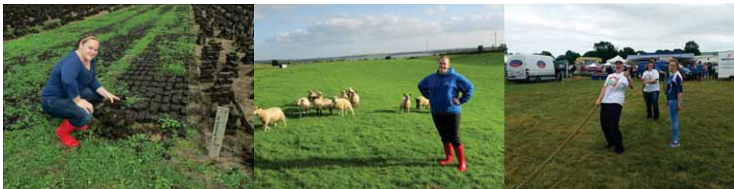
Above (L-R) - Turf dried from the bogs to burn like wood; A Macra member's personal sheep flock; Tug of War at a County Show (fair).