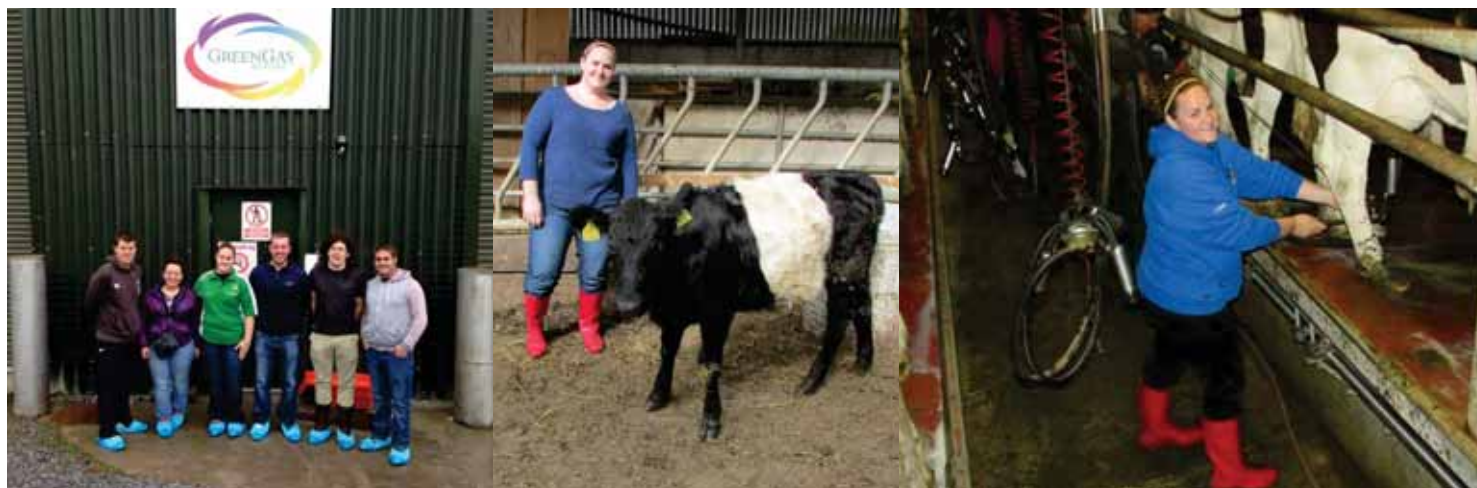
Below (L-R) - Touring a biodigester for Macra's upcoming AGM; A host and past delegate to Canada's Beltie (Belted Galloway); Milking in an Irish parlour.