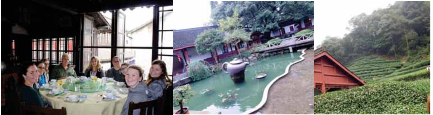
L-R: Lunch Family Style; Teapot Fountain at Longjing Tea Farm; The view from the farm gate (tea farm)