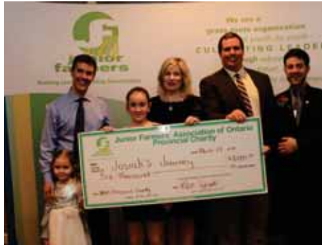
Josiah's Journey receiving a cheque from JFAO for $6000.00 at MC 2016

Josiah's Journey is proud to partner with one of the world's leading and most advanced hospitals. When a child or adolescent has a potentially life-