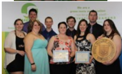
Top Junior Farmer Club: Perth JF (right)