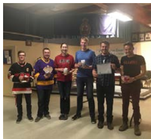
First Place Winners: City Slickers